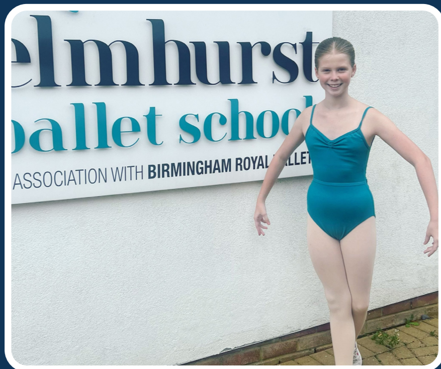
Scarlett B British Ballet Organisation